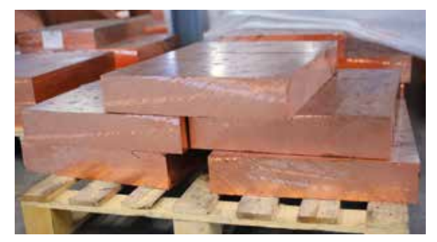
Extruded copper slabs