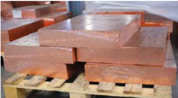
Extruded copper slabs